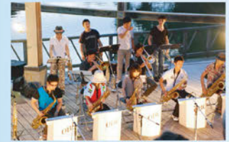
Evening Breeze Jazz Concert