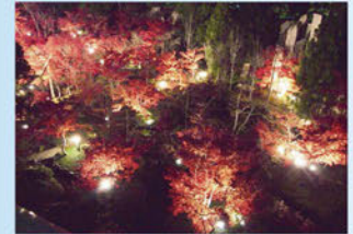
Autumn Maple Illumination

There are many more cultural events and concerts available. For more information, please visit our website.